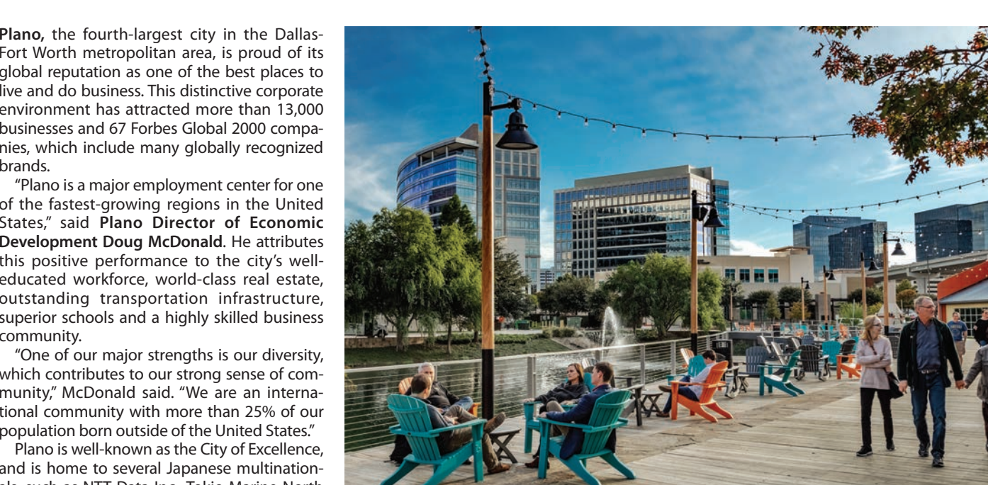
The Boardwalk at Granite Park in Plano offers various dining options and an amazing waterfront view in a casual family-friendly atmosphere.