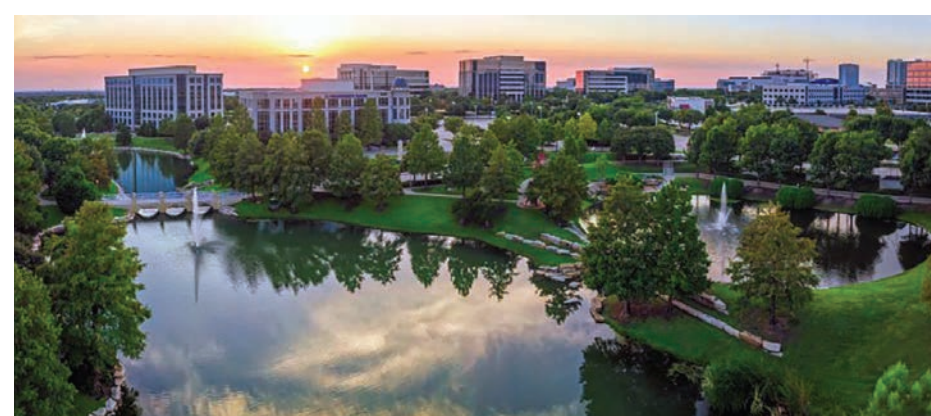
Hall Park in Frisco is a major business center in North Dallas, providing more than 200,000 square eters of Class-A office space across a 65-hectare mixed-use development