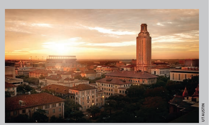
Nearly a century old, the UT Tower has become one of the most recognizable symbols of the city and the University of Texas in Austin.

GIL formed a partnership with Aichi Prefecture to support entrepreneurs in the region and conducted a training program called Advancing Women and Youth Entrepreneurship, which was funded by the U.S. Embassy in Tokyo. GIL designed the program to provide