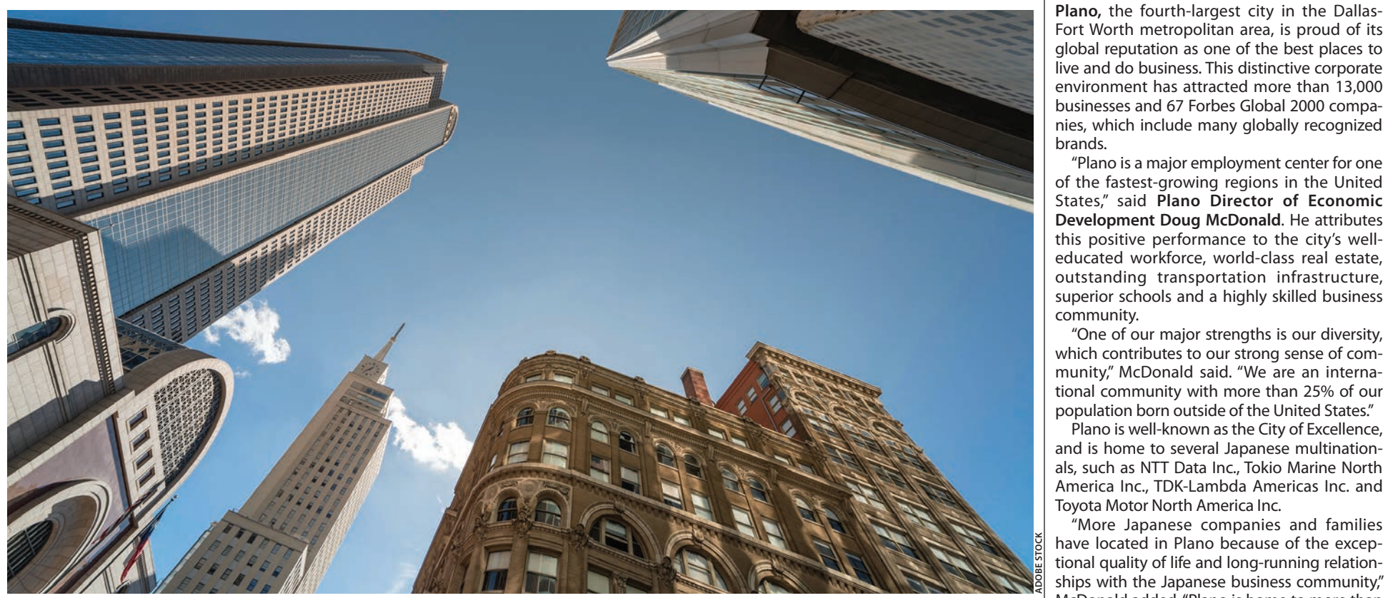
Everything is looking up in Texas. Over the past decade, foreign multinationals and international investors have moved to the state, having found the right conditions to grow their businesses for many years to come.

thriving workforce, expanding economic diversity, and increasing economic growth have made Texas one of the leading destinations for foreign direct investment in the United States, with the bulk of it coming from Japan.